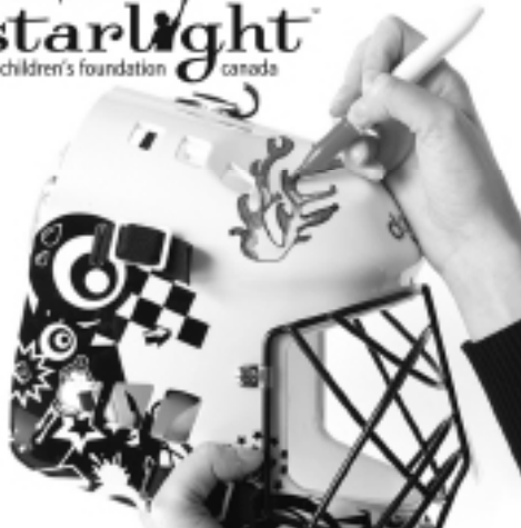
DOODLEZZ STREET HOCKEY HELMET

fondation pour l'enfance starlight children's foundation canada